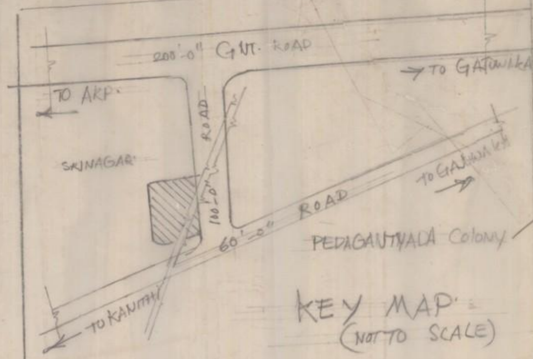
KEY MAP (NOT TO SCALE)